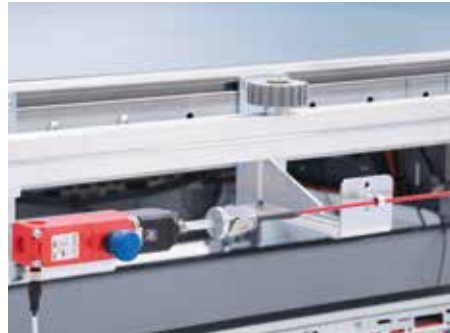
Equipment to achieve CE-conformity: rip cord back to the return belt