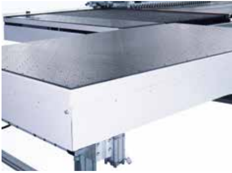
Liftable air cushion table for outfeed (option)