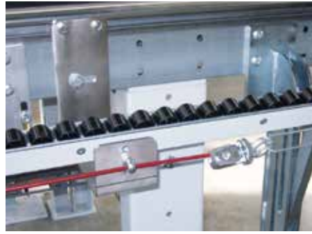
Small roller gib, lowerable (option)