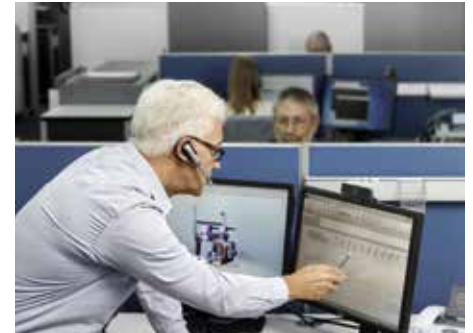
Remote Service: Excellent machine availability thanks to shorter periods of idle time and therefore lower production costs.