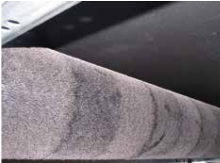
Belt cleaning equipment